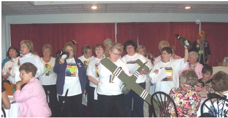
The UP invites us to Iron Mountain next May 14 – 16 for the GFWC MI Convention