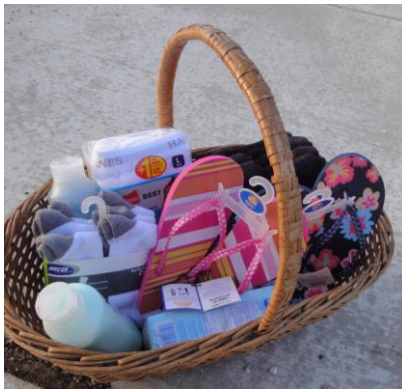
Donations to City Rescue Mission