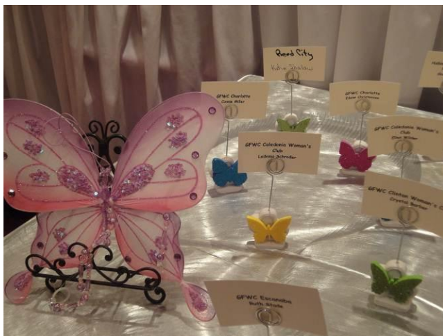
Education Foundation Skit Cheerleaders